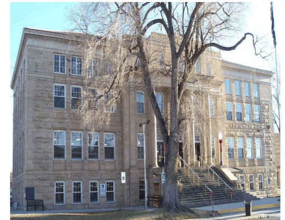
Montrose County Courthouse